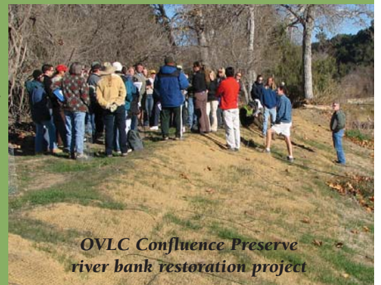
OVLC Confluence Preserve river bank restoration project

On January 22, 2007, OVLC hosted a tour of two restoration projects within the Ventura River Watershed that utilized bioengineer-