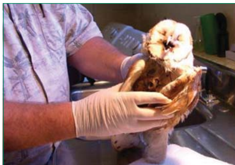
Dead barn owl recently found on Ojai Meadows Preserve. Suspected cause of death: rodent poison.

When poisoned, weakened rodents are eaten by raptors, who also ingest the poison, sometimes in large enough doses to kill. In the past few months, 5 dead raptors have been reported found in the Ojai Valley, apparent victims of rodent poisoning.