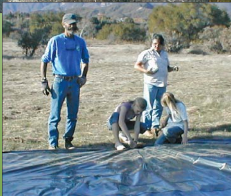
Securing tarps with staples