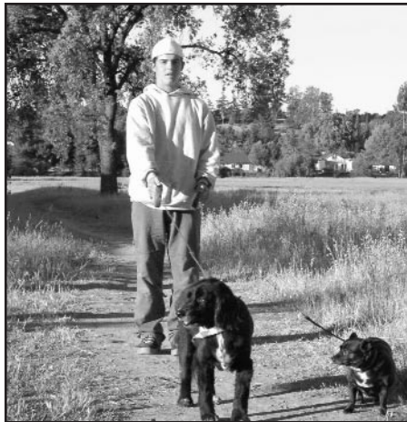
Leashed Dogs Are A Must At Preserve