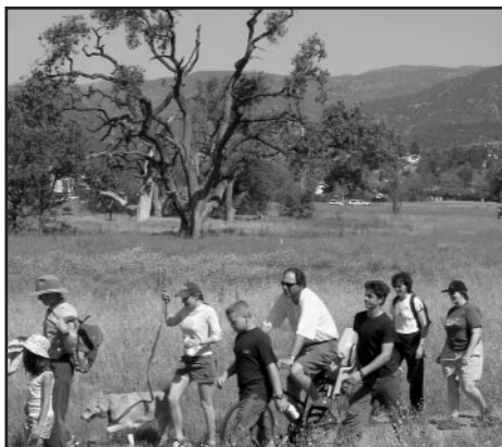
Earth Day Walkers Enjoy The Ojai Meadows Preserve.

O ak Grove School students, parents and staff came up with a great idea- to sponsor an Earth Day walk from downtown Ojai to Oak Grove School while raising money for open space protection. The inaugural walk, which coincided with their annual Spring Art Festival, was