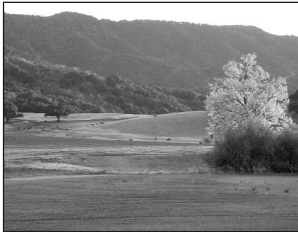
A beautiful view of upper Ojai.

The Save Our Open Space (SOS) envelope found in each issue of the Open Spaces newsletter is designed for supporters wishing to make an extra gift in addition to their regular annual membership contribution. Why make an extra gift? Maybe you wish to help a specific program like education or habitat restoration.