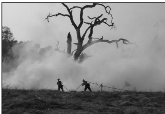
Firefighters Battle November 2001 Blaze at Preserve.