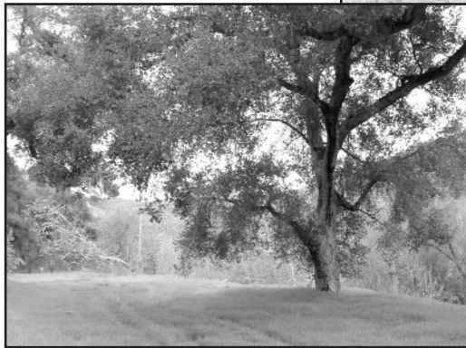
(left) Now - Nature Takes Over