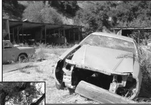
(top) Before - A familiar scene on Creek Road