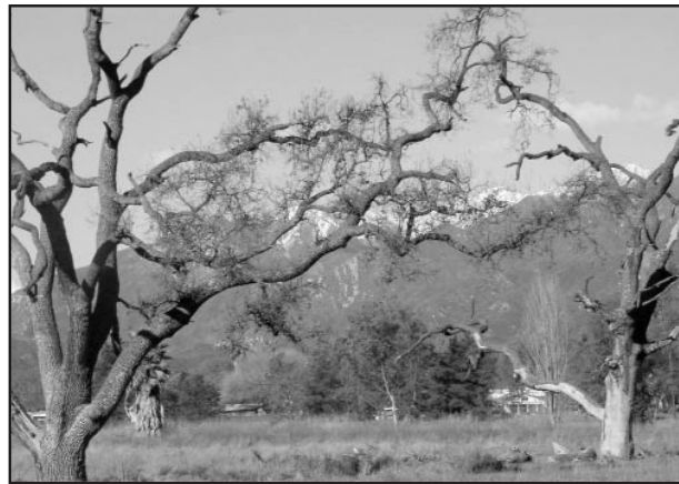
Ojai Meadows Preserve

Last November’s 5-acre fire at the Ojai Meadows Preserve